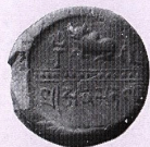
Terracotta sealing depicting 'Avimukteshwar' in Brahmi script of 8th cent. AD from Rajghat.