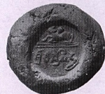
Terracotta sealing depicting 'Shri Sarvatraividhy' in Brahmi script of 5th cent. AD from Rajghat.